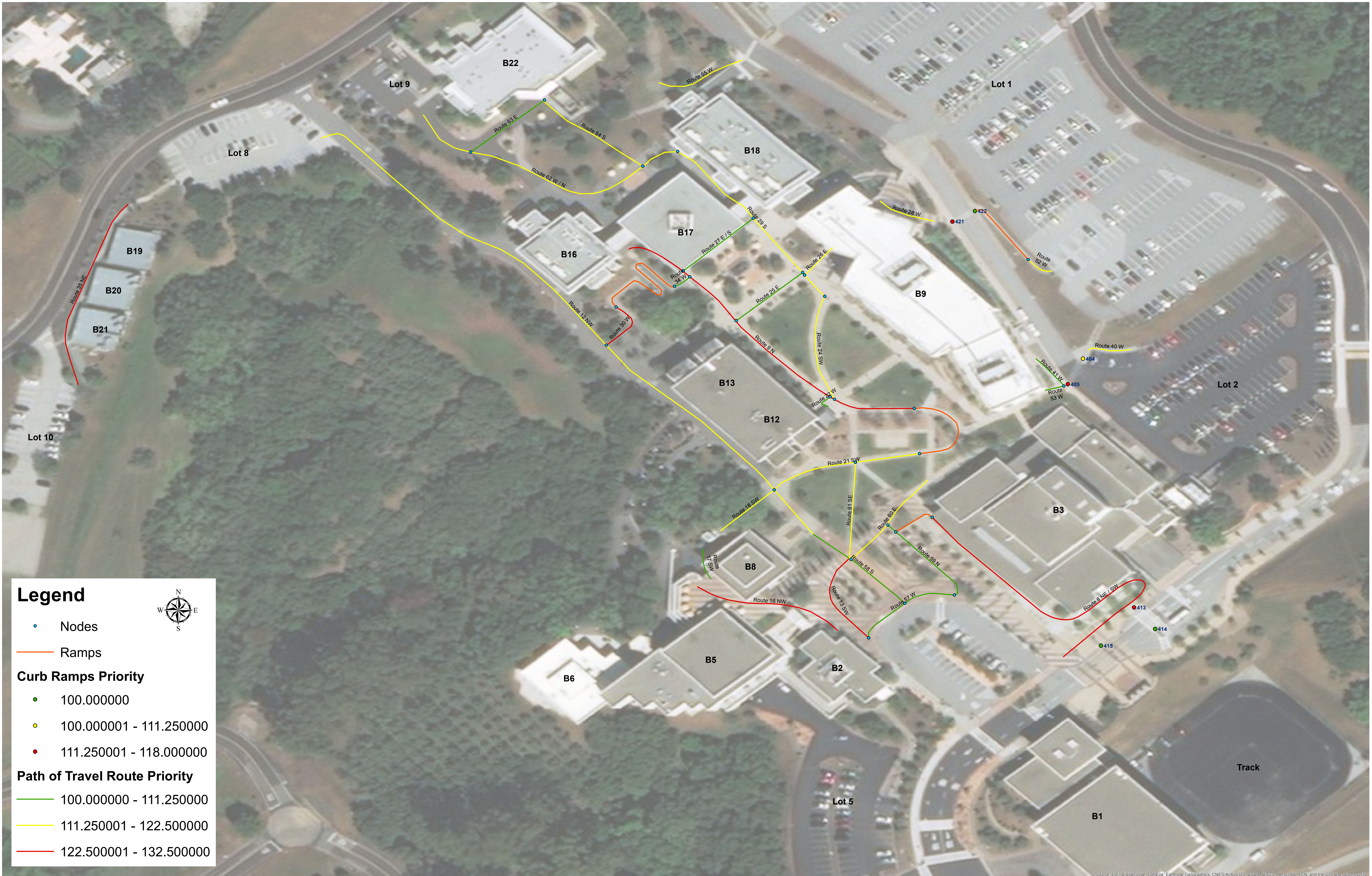
Cañada Path of Travel Routes