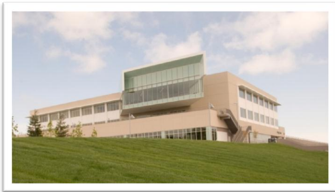
College of San Mateo College Center