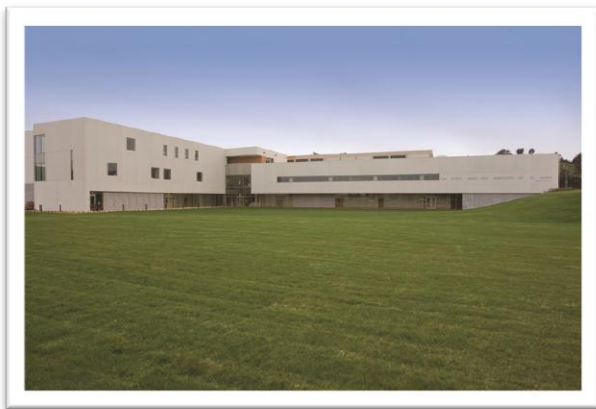
Skyline College Building 4