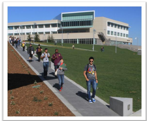
College of San Mateo Diagonal

Completed Projects – The following projects were completed between 2010 and 2011: