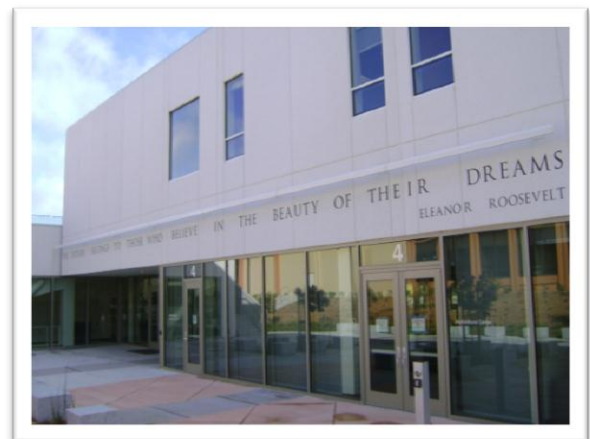
Skyline College Building 4 Inscription