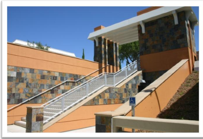
Cañada College Building 5/6 Stelevator