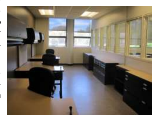
New Faculty Office