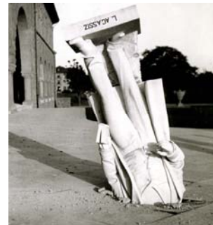
A toppled statue of geoscientist Professor Louis Agassiz on the Stanford campus following the 1906 earthquake. It is one of several still shots used in The Damnedest Finest Ruins. Agassiz' statue has been returned to the front of the Stanford quad.