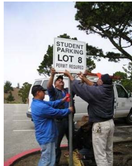
Facilities staff is standardizing the look across the campus and is working hard to place new signs in all parking lots before the start of the semester.