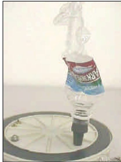
Switch on vacuum pump, open manifold valve and observe bottle.

What has caused the bottle to be crushed?