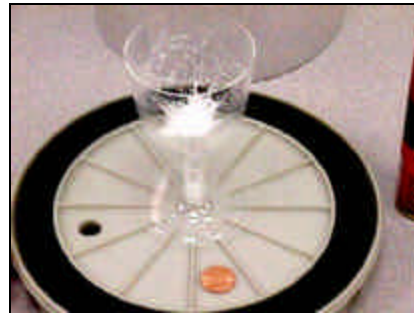
After venting to air.