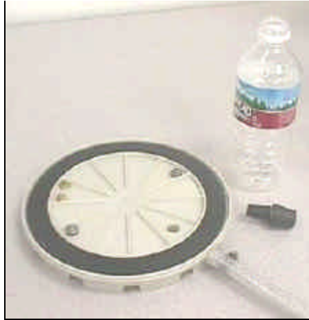
Plastic water bottle; empty and dry