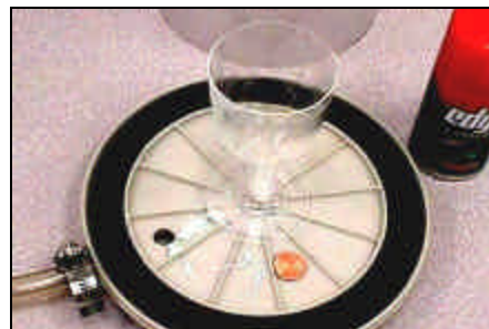
After. Cleanup still required.