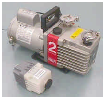
Vacuum pump and oil mist filter.