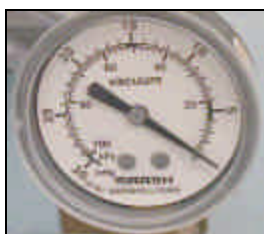
Vacuum gauge at atmospheric pressure