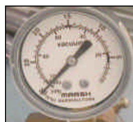
Vacuum gauge at vacuum pressure