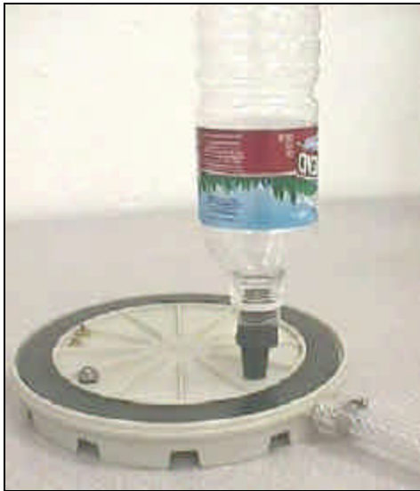
With vacuum manifold valve closed, insert bung/bottle as shown.