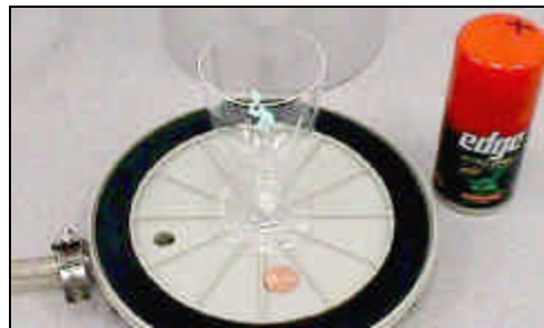
Before. Note very small amount of gel.