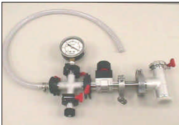
Vacuum connection assembly: Vacuum gauge, vent valve, vacuum shutoff valve.