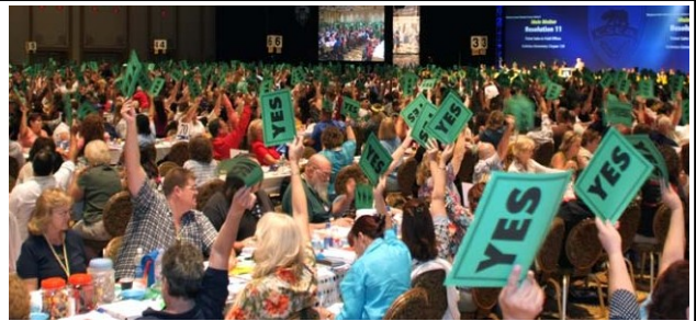
CSEA 85th Annual Conference, Las Vegas, NV

Delegates voted on many conference resolutions, including #11 ("Dues Increase for 11 and 12 Month Employees"). It was discussed at the July Drive Release. For more information about these resolutions, go to this link: http://www.smccd.edu/accounts/csea/2011_Conference_resolutions/2011_Resolution.pdf