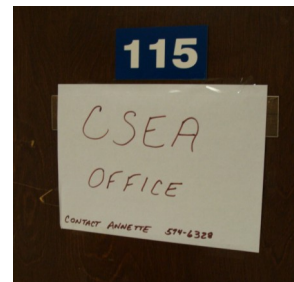
Chapter 33 Office has a new location!

Your CSEA Chapter 33 office has moved once again. The office is now located in Building 1, Room 115. There is still much to do to get the office organized and operational. Your help would be appreciated. Call 524-6968 to volunteer!