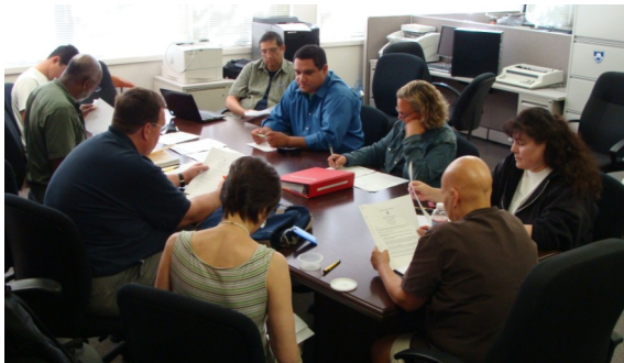
Your E-Board met in the new Chapter 33 office

For information about Chapter meetings, Chapter Elected Officers, Chapter Events, Member Benefits and access to past and present Chapter 33 newsletters and Monthly Reviews, visit your Chapter website at http://www.smccd.edu/accounts/csea/