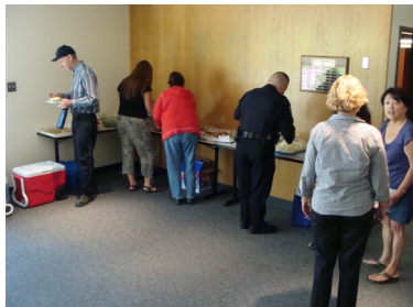
Members enjoyed a prepared lunch