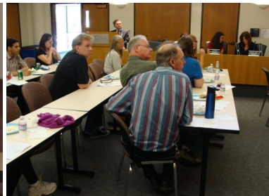
Members listened to concerns